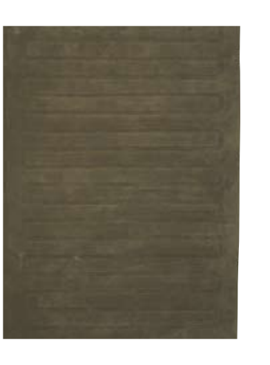
PLOW Mats Theselius