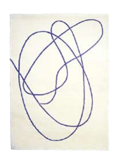
KNOT Alfredo Häberli