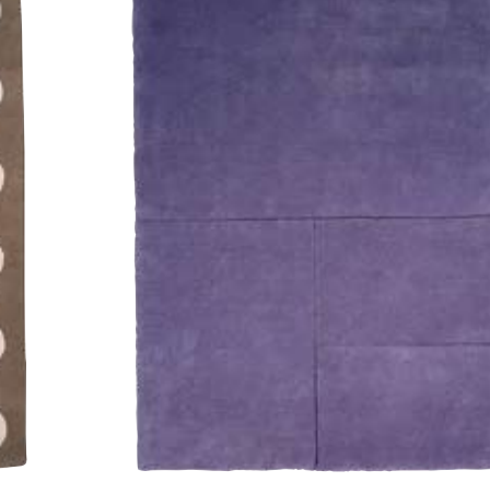
FOLDED Harri Koskinen