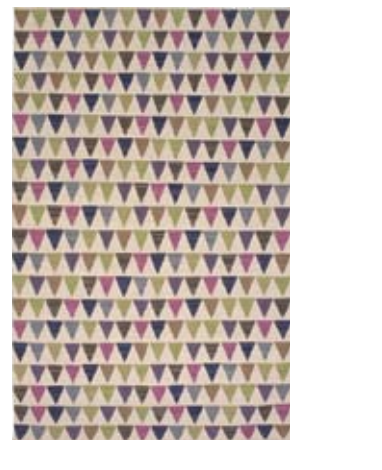
MINIFLAG BLUE Thomas Sandell