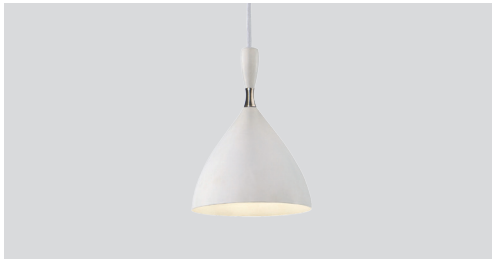
Dokka off-white – Item no. 250