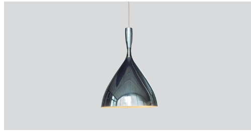
Dokka chrome – Item no. 251