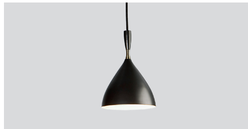
Dokka black – Item no. 253

Design: Birger Dahl Year: 1954 Type: Pendant lamp