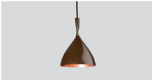
Dokka brown – Item no. 252