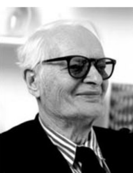
The Swedish architect and inventor of the famous String system, Nils Strinning was among a group of mid-twentieth century designers that helped to build the foundations of what we now call Scandinavian Design.

That's not surprising when you notice how cleverly Nils Strinning combined the inventor's demand for functionality with the aesthetes feeling for proportion and detail. The result is a timeless combination; at once classical and contemporary.